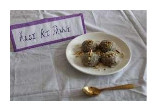
Dishing out Haryanvi & Punjabi dishes