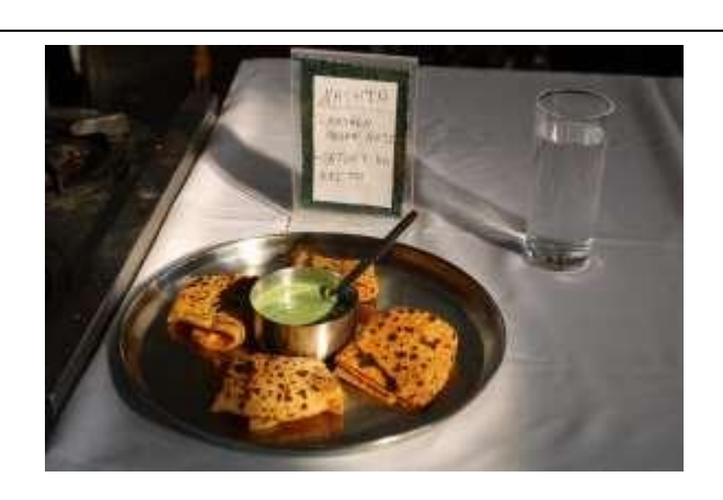
Dishing out Haryanvi & Punjabi dishes