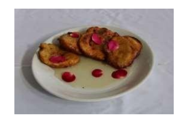
Dishing out Haryanvi & Punjabi dishes