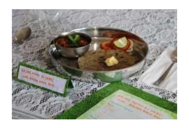
Dishing out Haryanvi & Punjabi dishes