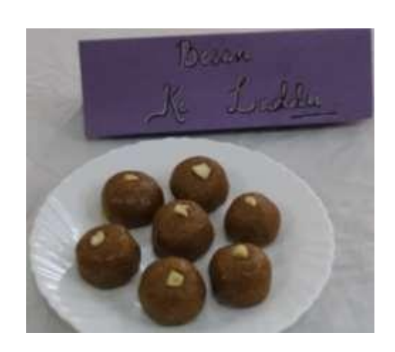
Dishing out Haryanvi & Punjabi dishes