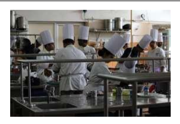
Culinary Competition in progress, students preparing lipsmacking Haryanavi & Punjabi Cuisine.